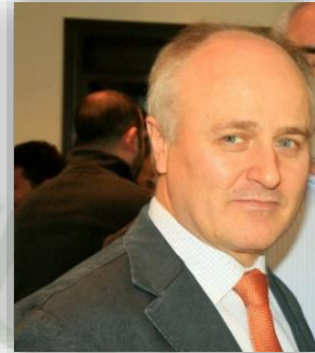
Angel Custodio - President of European Council of Social sciences